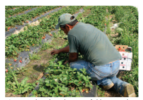
An agricultural worker in a field irrigated with recycled water.

Among the perceived risks is concern about the presence of trace concentrations of Pharmaceuticals and Personal Care Products (PPCPs) found in recycled water. But findings from a recent study indicate that, depending on the chemical and the exposure situation, it could take anywhere from a few years to many millions of years of exposure to nonpotable recycled water to reach the same exposure to PPCPs that we get in a single day through routine activities.