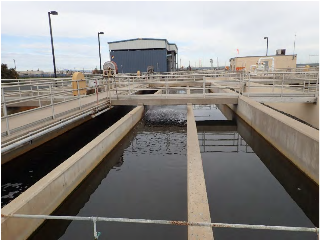
10. Chlorine contact chamber.