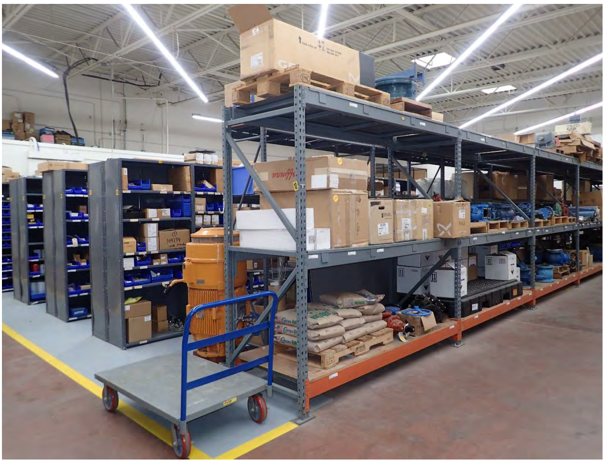
19. Maintenance storage area.