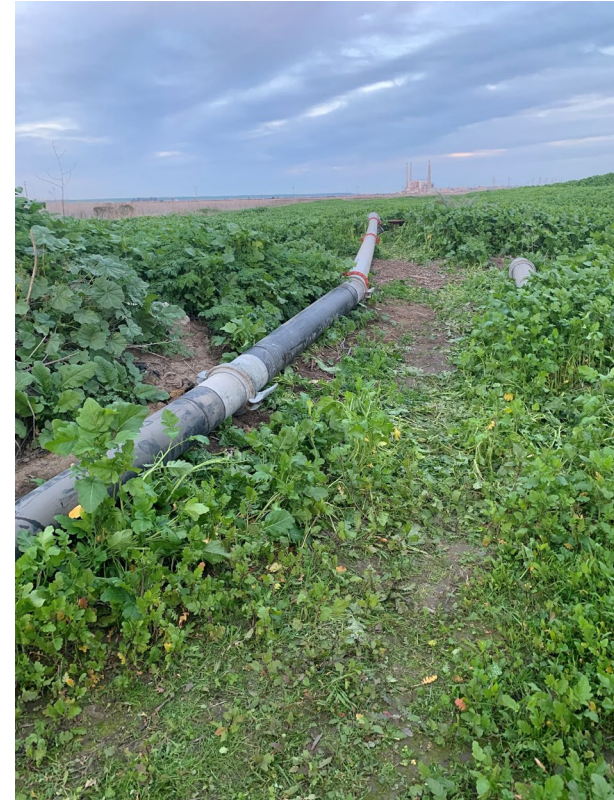
Temporary bypass piping discharge to downstream manhole