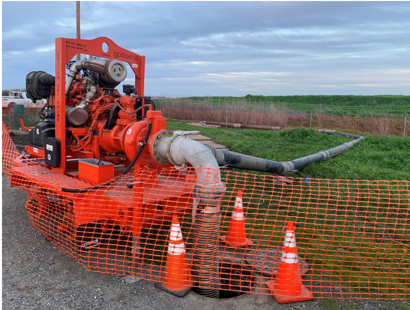
Temporary bypass pump system