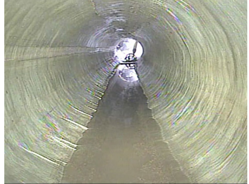
Post-installation CIPP liner