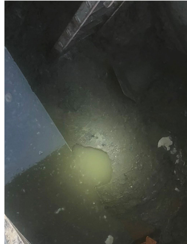
Pipeline failure (two holes, <1 foot in diameter)