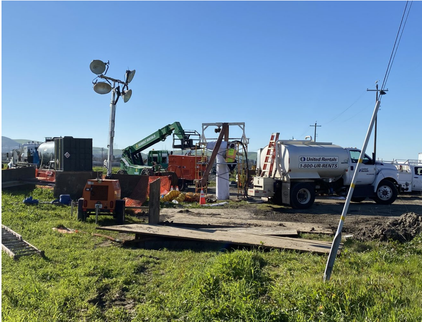
CIPP installation setup