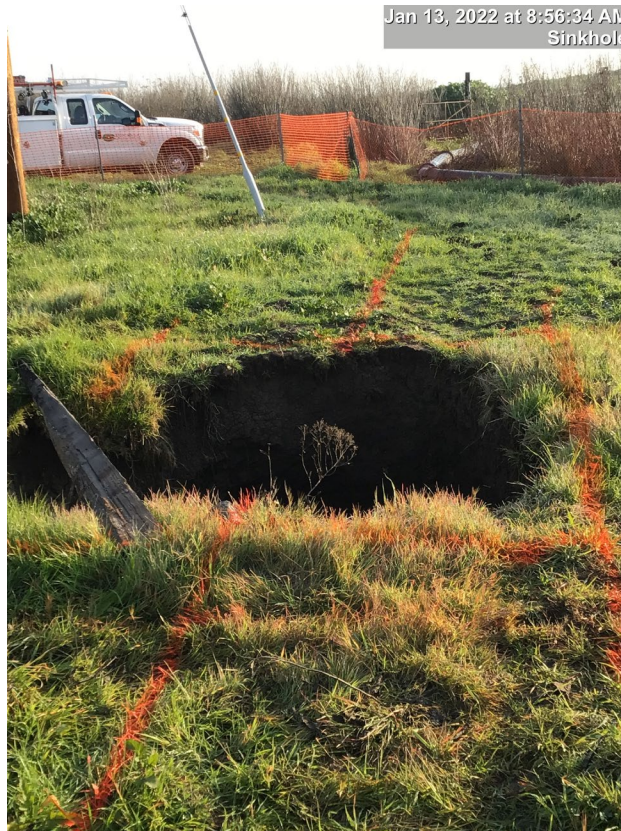
Sinkhole prior to being exposed and stabilized with shoring boxes